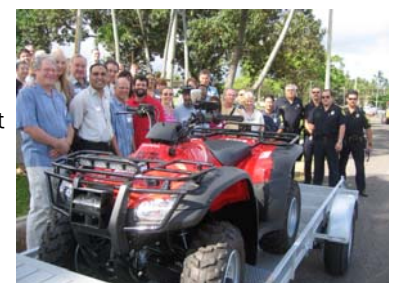
Chamber Board, members, police & guests at ATV trailer dedication