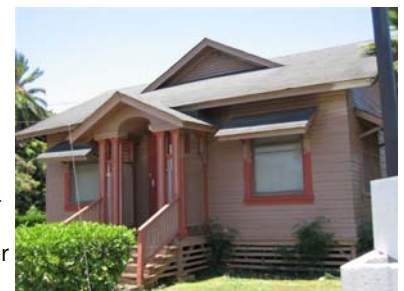
Telephone Exchange Building

Business After Hours. We held three Business After Hours events this year at Alluvion, Turtle Bay Resort and Camp Erdman. They were extremely successful and fun. The event hosted by Alluvion highlighted agriculture with North Shore farmers donating the food and displaying their products. There was so much food that it ended up being a feast of tasty North Shore dishes and drinks all made on the North Shore rather than just pupu. People attending were able to see the large array of food and drinks produced on the North Shore. The Turtle Bay event was held on the front lawn and was a lovely setting. The food, drinks and networking were enjoyed by all. (Continued on page 3)